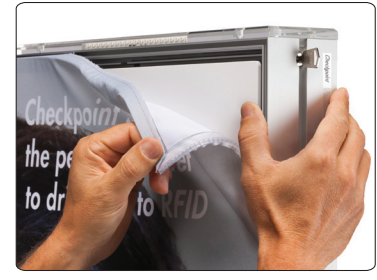
Easily interchangeable graphic panels

*denotes capability of RFID-equipped pedestals