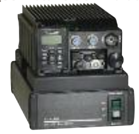
20 Watt AN/VRC-111 Vehicle Adapter Amplifier