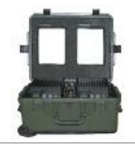
50 Watt AN/VRC-111 Vehicle Adapter Amplifier Dual Channel